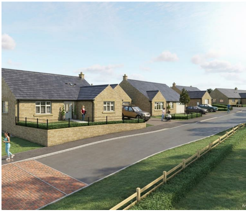
THE GAINSBOROUGH WO BEDROOM BUNGALOW