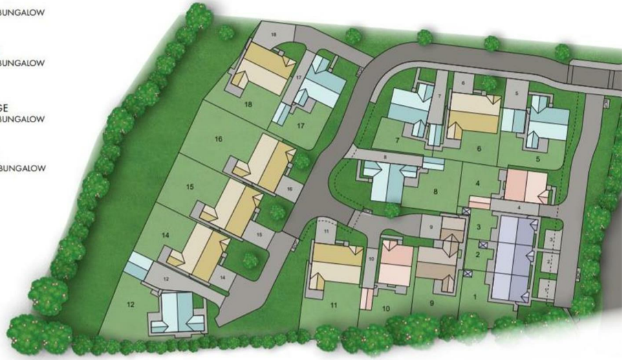
THE WOBURN HREE BEDROOM BUNGALOW